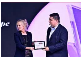
ProWine: Honoring Excellence