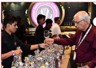
ProWine & ProSpirits Challenge