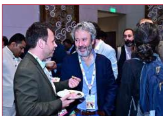
ProWine Mumbai Night