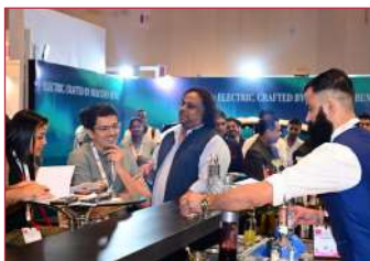
ProWine Bartenders' Competition