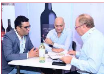
B2B Networking Evening